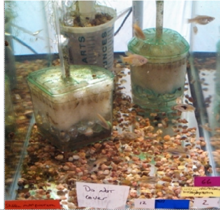
A perfect basic tank ready for more fish and plants. This 29 gallon tank has box filters, a gravel filter and a single layer of gravel lightly over the tank bottom.