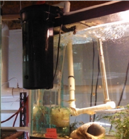
A hang-on-the-side Magnum canister filter for quick resolution of water cloudiness issues.