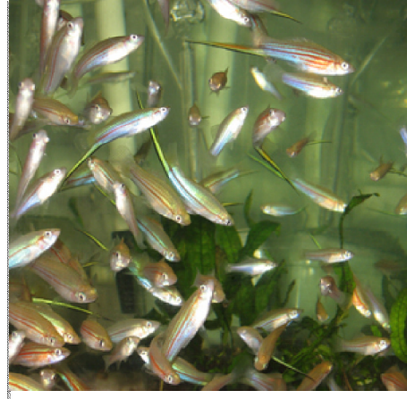
When raising the fish that breed for you, clean conditions allow for fish with good size and color. These are Xiph. alvarezii