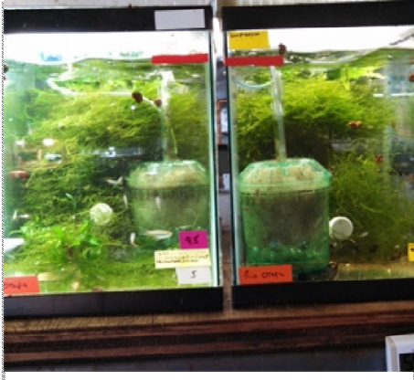
Box filters- the best choice for simplicity, low cost, effectiveness and cleanliness.