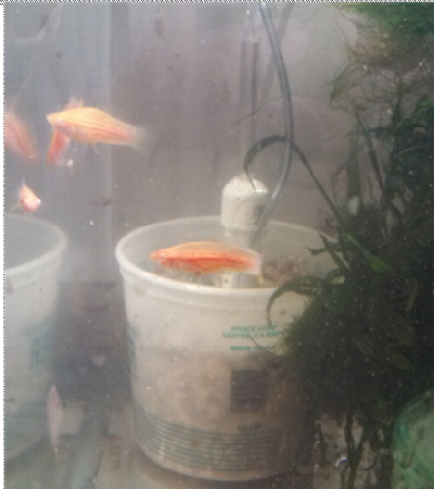
A Homemade Gravel filter made to specifically boost biological filtration. These work best with a 1/4" sifted pea gravel to provide maximum water flow. These need to be cleaned every 2 months.

The quality of the water deteriorates in a number of ways, most due to the inevitable buildup of organic material that happens in most aquariums. There are ways during the initial setup to create a tank where you are always aware of what is going on, that organic buildup stays at a minimum, and you can be confident that the fish experience the best odds of a consistent, healthy environment.