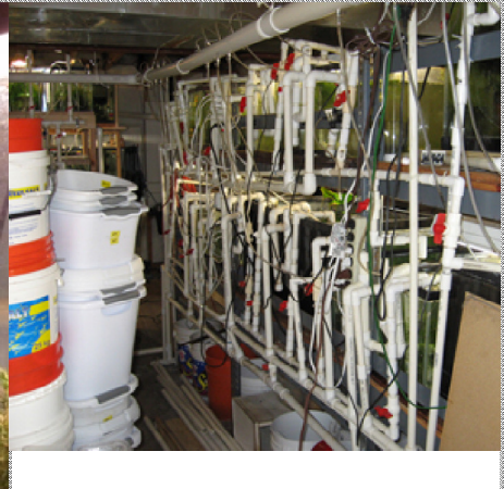
A fishroom like this isn't for everyone. This is a look at the automatic water change system and air lines behind two of the 14 racks at Select Aquatics.