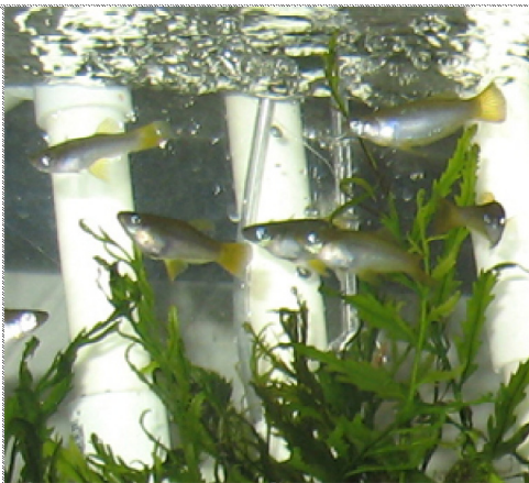
The fry of the Alfaro cultratus are thin, 5-6mm slivers that at first group together just beneath the surface.

A solution to capturing and raising all of the fry with a female that can't be moved is to build a large breeder that hangs into the tank, with some fine leaved floating plants. Though separated from the other adults, the female is still in the same tank, she doesn't feel particularly confined, and will generally give birth normally. The fry then are easy to see once they are born, and the female can be put back into the main tank for the young to be raised separately.