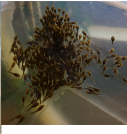
Day 7. They haven't suddenly become dark it is simply the light, but their dark natural color has begun to develop.