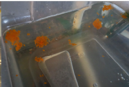
5 hours old. Immediately they clump together for safety.