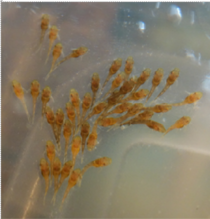
Day 6. At this point feeding of frozen BBS and ground cichlid pellets begin. A few green beans are offered and changed daily.