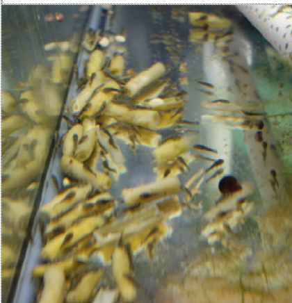
Day 9- The new pleco fry get their own digs in a regular, filtered, bare bottom tank. Mulm is kept siphoned up about every other day.

To the right is a line in development, and if all goes well, the first of this line to be sold will be the young of this generation. Not clear in this photo, the body length of this fish is nearly half tail!