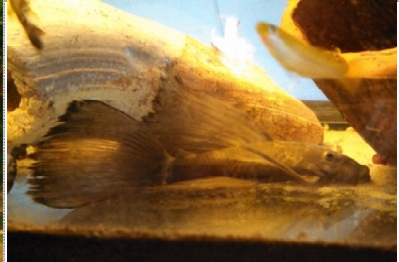
The Longfin Green Dragon Bristlenose Plecostomus. A male is on the left, a female is on the right.

The bristlenose pleco can be bred easily if a couple issues are addressed. If a few aspects of their care aren't done to the fish's satisfaction then you will be as I was for over 2 years, where nothing I did seemed to trigger a single spawn. Today I have to keep them separated as there are now many tanks of fry here with regular, routine production. So what made the difference? Though you may get an occasional breeding in the tank provided for your plecos, what is described here should guarantee consistent breeding of capable breeding pairs, with maximum yield of fry that are raised with few if any losses.