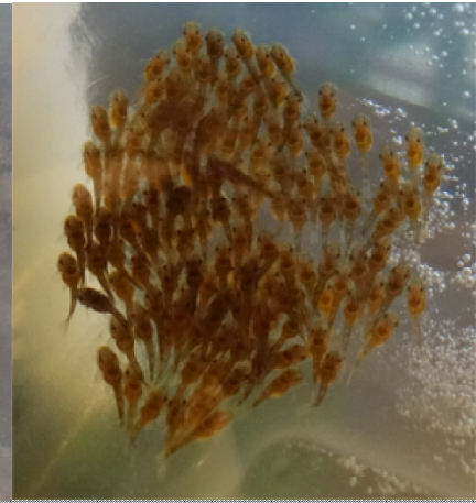
Day 5. Through this entire time, they are not being fed anything, and provided with aeration and twice daily water changes.