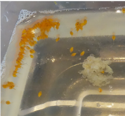
Just hatched. Notice the whitish structure the eggs were encased in on the right.

This next fry sequence are all of the same batch.