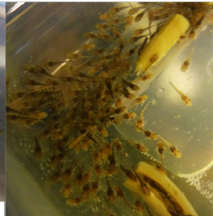
Day 8. The lighting here begins to show the differences in shading between individuals.